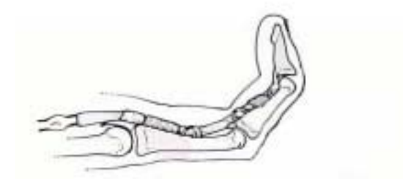
Figure 2. A small tear in the tendon has healed with a swollen scar.

The inflammation is most often due to repeated traumatic microscopic tears in the tendon. It can be due to infection, or some unknown cause. The tendon and its synovial sheath become swollen and may develop scarring. The swelling on the tendon, when flexed, lies outside the mouth of the first pulley. Attempts to straighten the finger are met with resistance when the swollen tendon is pulled up to and eventually through the narrowed pulley mouth at the base of the finger the trigger occurs.