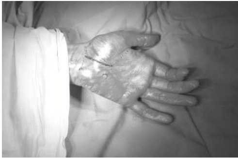
Figure 1. The carpal Tunnel marked out ready for surgery.