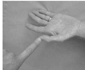
Figure 3. Weakness lifting the thumb may be a sign of carpal Tunnel Syndrome

Your doctor may diagnose this condition if you have the symptoms described above. The signs of carpal tunnel syndrome include swelling, weakness of the thumb and loss of sensitivity in the hand.