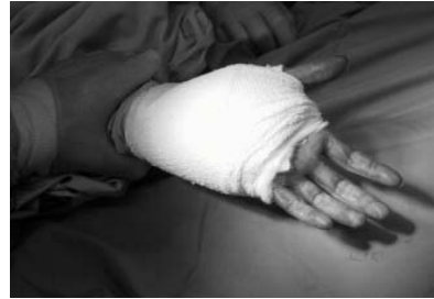
Figure 2. The bandaged hand with the wrist back

swelling down. You should maintain the elevation after you are taken home.