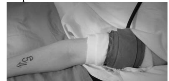
Figure 4. A tourniquet is used for approximately 11 minutes.

Please make arrangements to be accompanied home by a responsible adult after surgery. Do not eat or drink anything after midnight the night before the procedure unless you are instructed otherwise. Wash your arm the night before surgery and do not apply hand creams. Your operation will take place in the most modern facility by a trained Consultant surgeon who will explain each step of the procedure to you as it takes place. At surgery a local anaesthesia injected into the wrist and hand so you don't feel pain during surgery. Rarely, a general anaesthetic may be given. After skin preparation and draping a tourniquet is inflated around your upper arm to reduce bleeding during the operation.