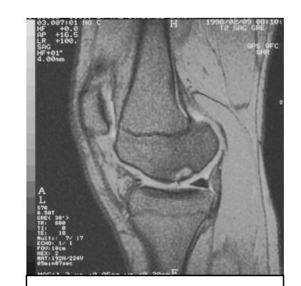
Figure 3. MRI of the knee showing injury to a discrete part of the surface of the joint.

surgery is that recovery is more rapid after arthroscopic surgery since smaller incisions are made.