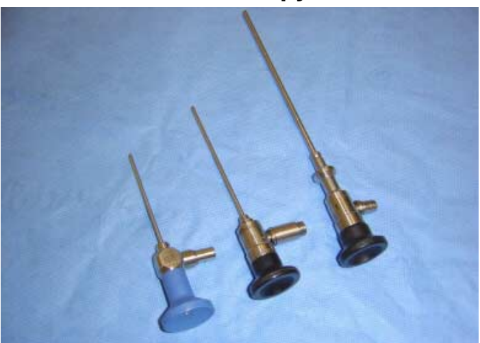
Figure 2. The scope on the right is used for knee arthroscopy.

Arthroscopy is the technique of looking inside a joint by using an instrument called an arthroscope.