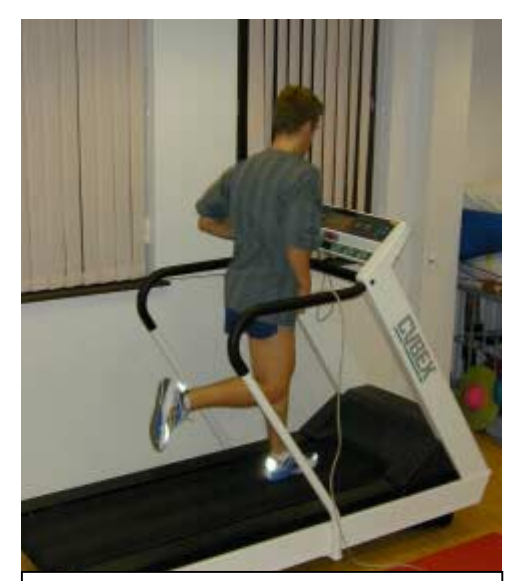
Figure 6. Cybex Running Mill to monitor progress.

light running. Make sure your foot and knee are fairly flexible before moving to twisting or impact activities, and make sure you can turn and jump comfortably before returning to contact sports.