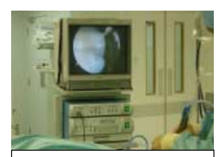
Figure 4. Arthroscopy is a skilled technique that should only be undertake by well trained surgeons

If you are medically fit, have someone who can collect you and look after you after the operation, and you are comfortable afterwards, the operation can be done on a day case basis. However, if you have other medical problems such as diabetes, obesity, asthma or high blood pressure, you may have to be admitted the day before for tests and stay overnight after surgery. If you cannot be collected and looked after you must stay overnight to avoid complications. Most knee arthroscopy is done as a day case operation.